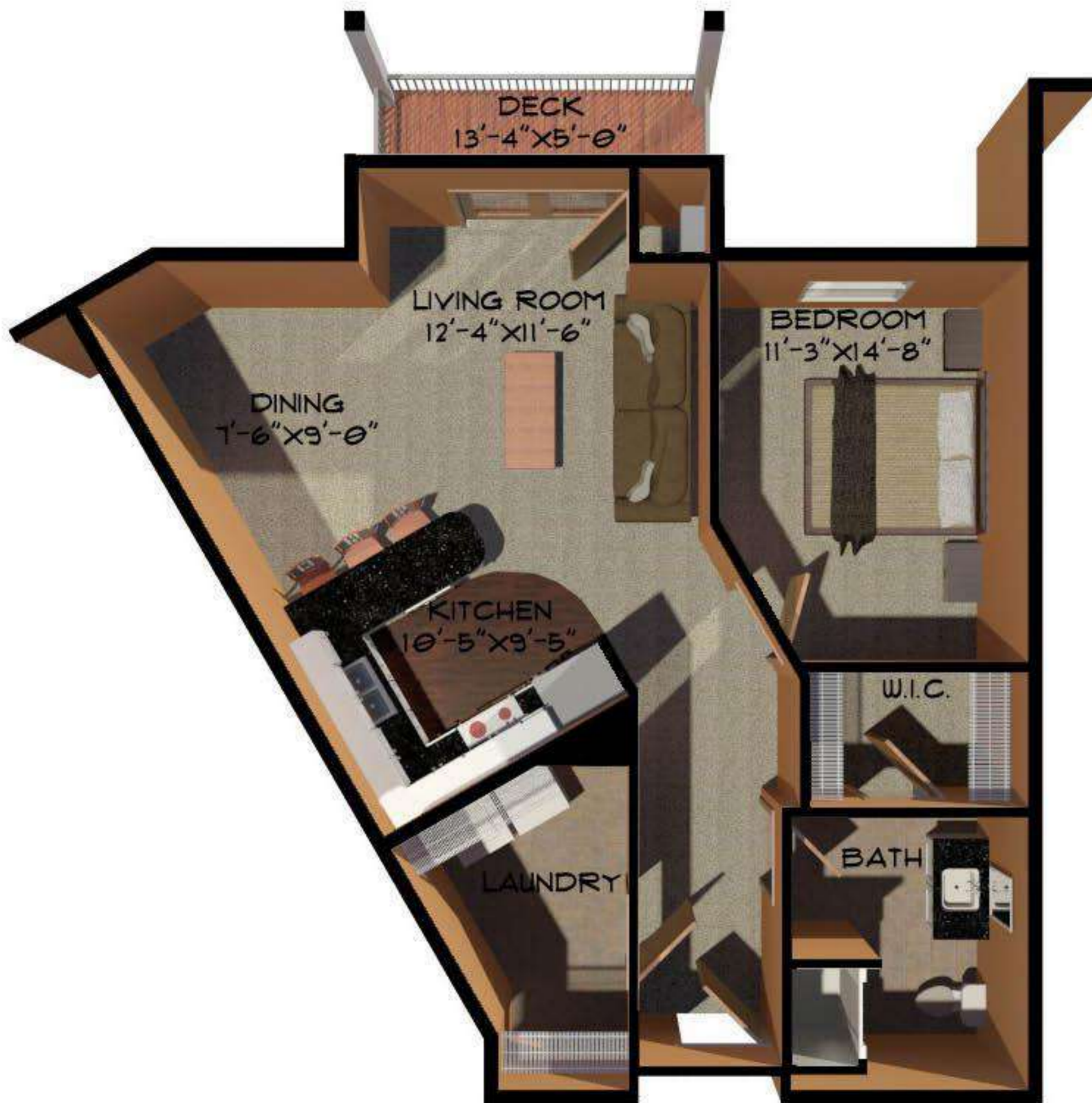
"WOODLAND" 825 S.F.