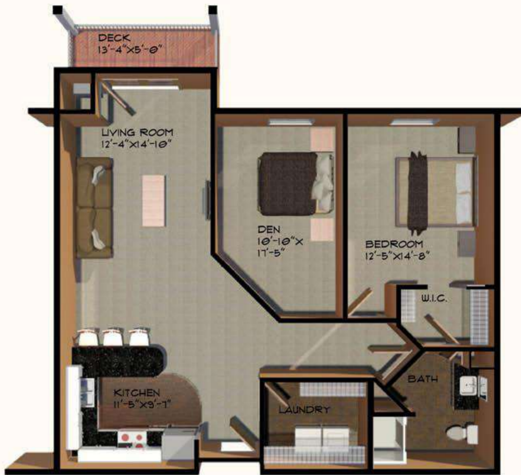
"LANDMARK" 1,111 S.F.